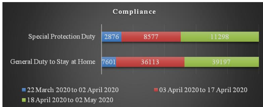
Chart 1: Results of Compliance by Citizens

In inspection actions pertaining to non-compliance, citizens generally respect the legal restrictions as well as GNR orientations, attending to the very satisfactory Results of Compliance shown in Chart 1. In total and during the State of Emergency, 22,751 citizens followed GNR orientations regarding the special protection duty and 82,911 citizens adopted GNR orientations concerning the general duty to stay at home. These results demonstrate the civic and conscious attitude of most citizens who promptly and voluntarily complied with GNR indications, in the case of non-compliance, especially pertaining to protection and retreat obligations.